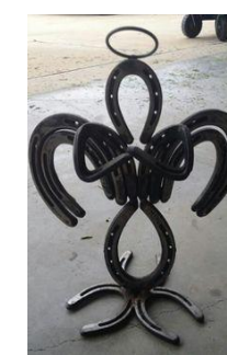
Horseshoe/Found Metal Art May 9 th / June 6 th / July 23 rd , 2018