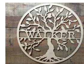
Family Tree Wall Art May 7 th / June 5 th / July 25 rd , 2018