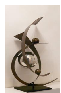
Abstract Sculpture May 14 th / June 12 th / July 18 th , 2018