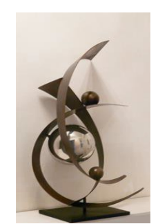
Abstract Sculpture May 14 th / June 12 th / July 18 th , 2018