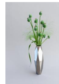
TIG Vase or Bowl May 8 th / June 4 th / July 24 rd , 2018