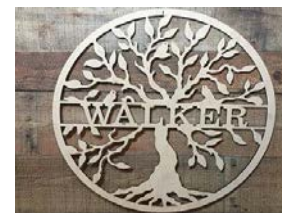
Family Tree Wall Art May 7 th / June 5 th / July 25 rd , 2018